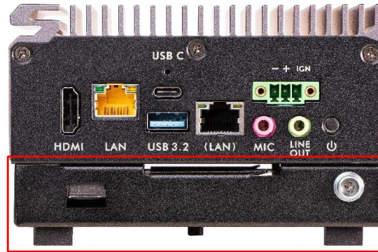
Shuttle Edge-PC SPCELxx with installed accessory HDD01