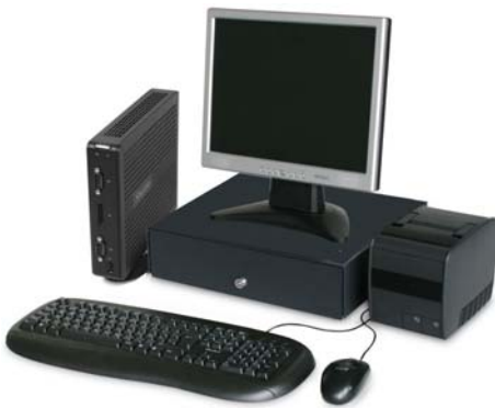
Point of sales with Shuttle XS36V-703