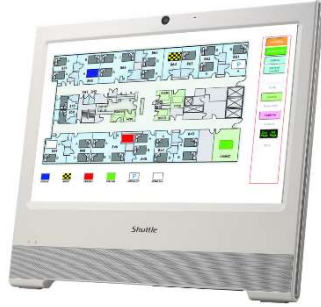
Device Control e.g. for health services or fitness equipment

Call System e.g. for nurses (hospital) or security personnel