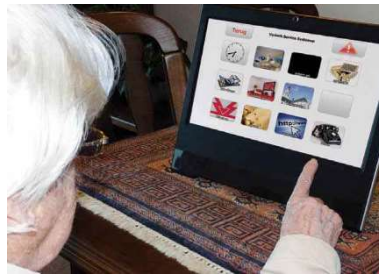
Communication Device e.g. for the elderly