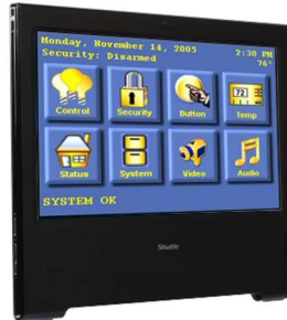
Smart Home Control Surveillance, Home Automation