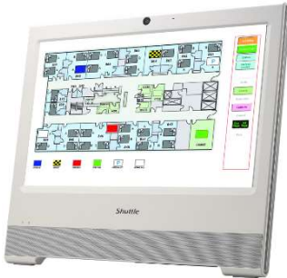
Call System e.g. for nurses (hospital) or security personnel