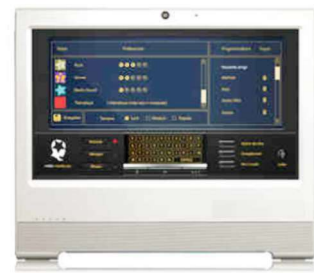
POS Radio Playing advertising and music