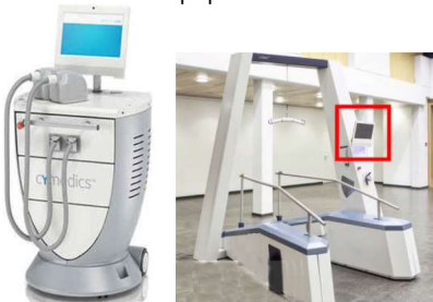
Device Control e.g. for health services or fitness equipment