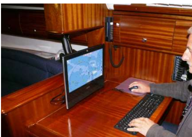
On a boat e.g. for navigation and entertainment