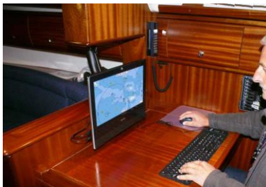
On a boat e.g. for navigation and entertainment