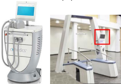
Device Control e.g. for health services or fitness equipment