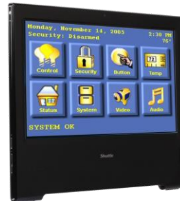
Smart Home Control Surveillance, Home Automation