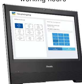
Data Collector e.g. Recording of working hours