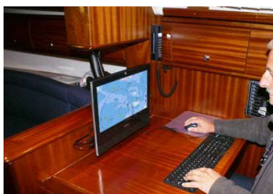
On a boat e.g. for navigation and entertainment