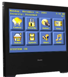
Smart Home Control Surveillance, Home Automation