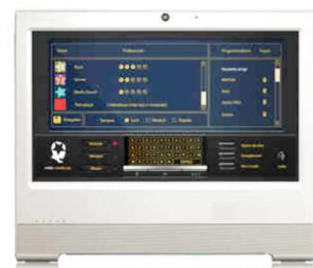
POS Radio Playing advertising and music