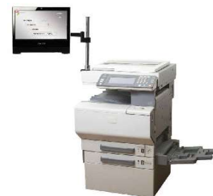
Device Control e.g. for copy machines