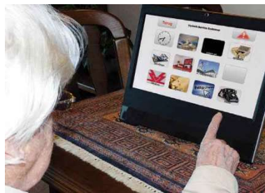
Communication Device e.g. for the elderly