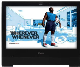
Digital Signage Visual advertising, Info Terminal