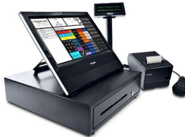
POS Checkout system in Retail Stores, Restaurants, Hotels