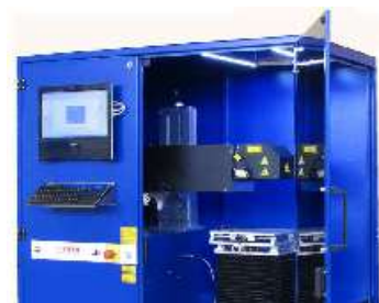
Visualisation e.g. for industrial production machines