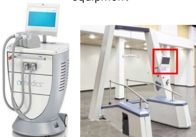
Device Control e.g. for health services or fitness equipment