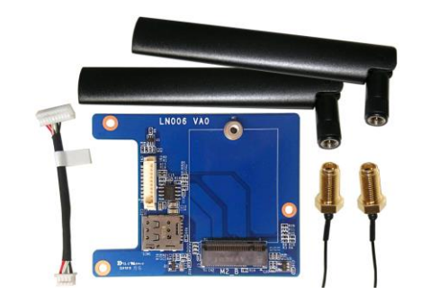
Note: M.2-LTE card and SIM card are not included.

LTE adapter kit for the 2.5" bay including two external LTE antennas